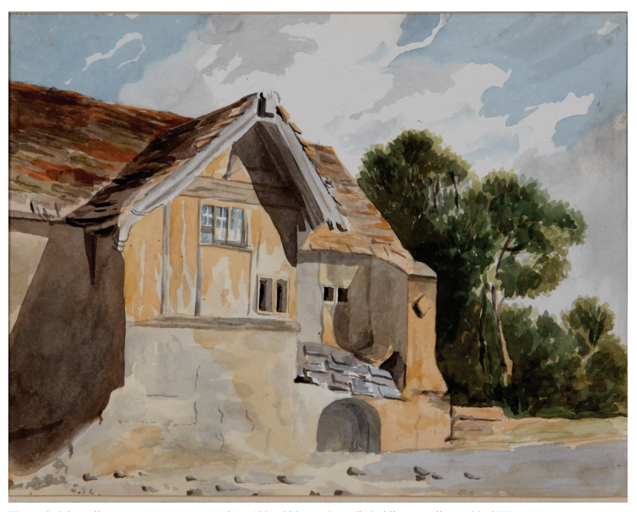
Figure 3. John Sell Cotman, Cottage, watercolour, 180 × 230 mm, Dunedin Public Art Gallery, 146-195X.

were appreciated for revealing the working processes and thoughts of the artist. This led to a commodification of the sketch as a sought-after collector's item. While the Society of Painters in Water-Colours had banned unfinished watercolours in 1823, by 1862 they had established a regular winter exhibition devoted solely to sketches and studies.<sup>51</sup>