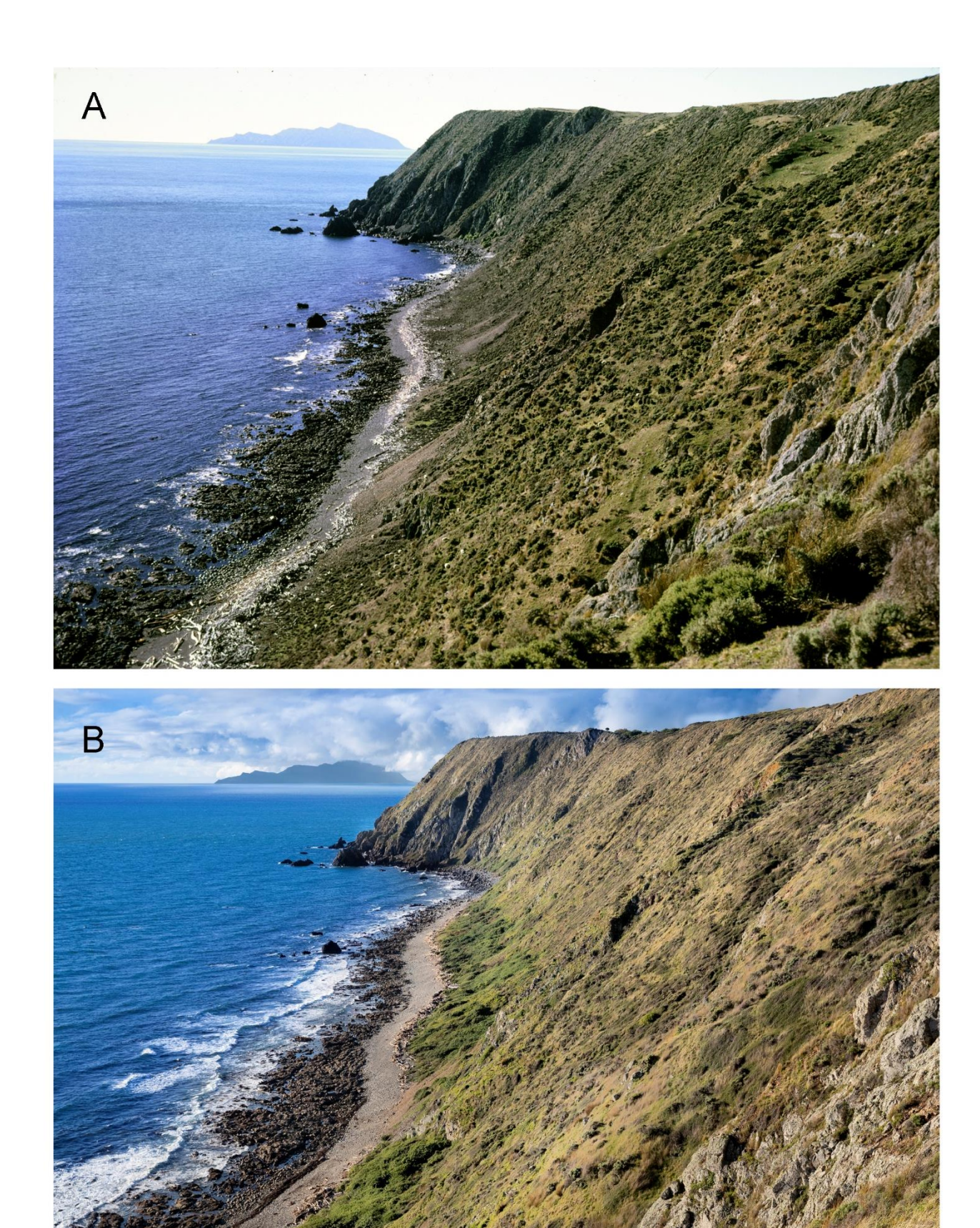
Figure S2. The west coast of Mana Island, looking north-east towards the trig and Kapiti Island. A. June 1972. B. June 2022. Note natural recovery of taupata at the foot of the slope.