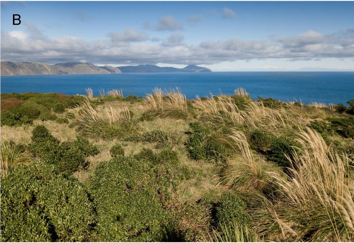
Figure S4. Looking south towards South Point, showing planted vegetation. A. June 1972. B. June 2022. Note the absence of flax at this site close to where flax weevils were released.