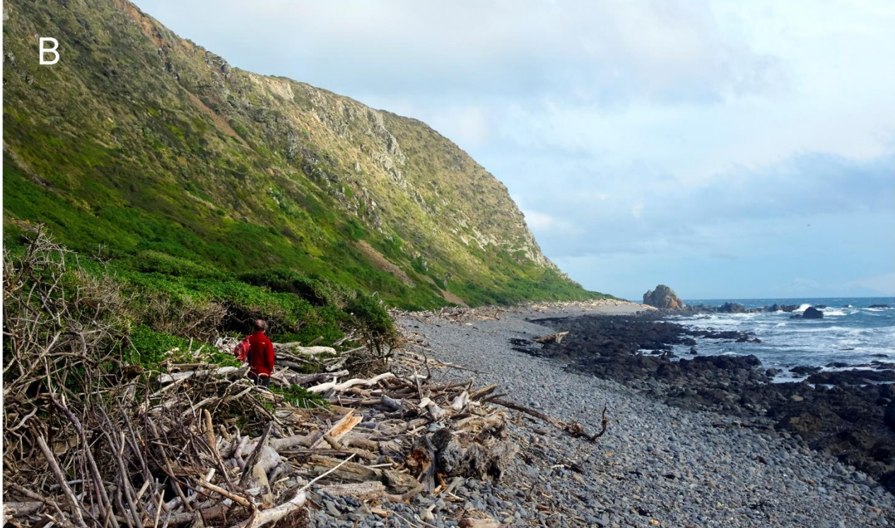
Figure S6. View south-west along the west coast of Mana Island, showing natural regeneration of taupata. A. June 1972. B. June 2022.