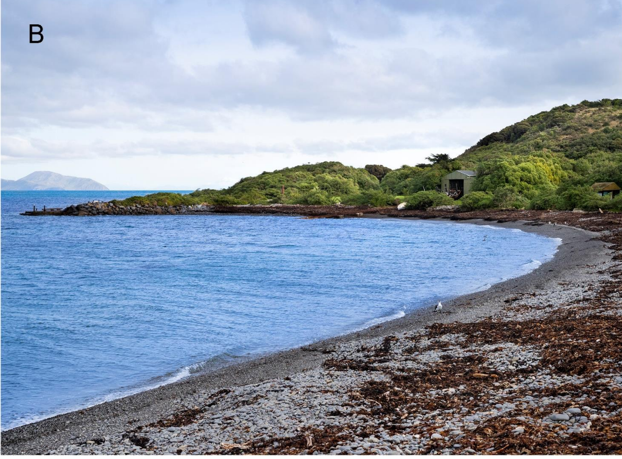
Figure S8. View south-west across Landing Bay. A. June 1972 (Image: Tony Whitaker, gift of Vivienne Whitaker, 2020, Te Papa CT.067094). B. June 2022 (Image: Maarten Holl, Te Papa, 206601).