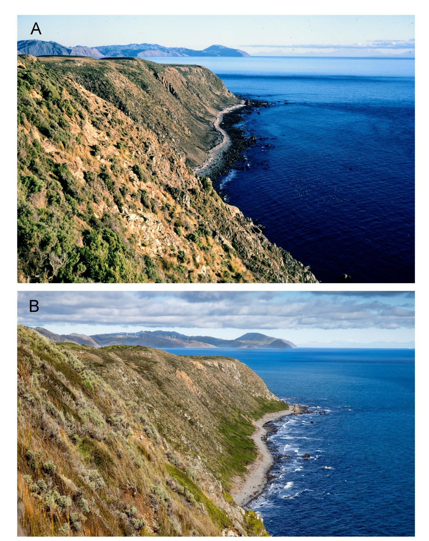
Figure S7. View south-west from near the trig, showing natural regeneration on the western slopes. A. June 1972. B. June 2022.