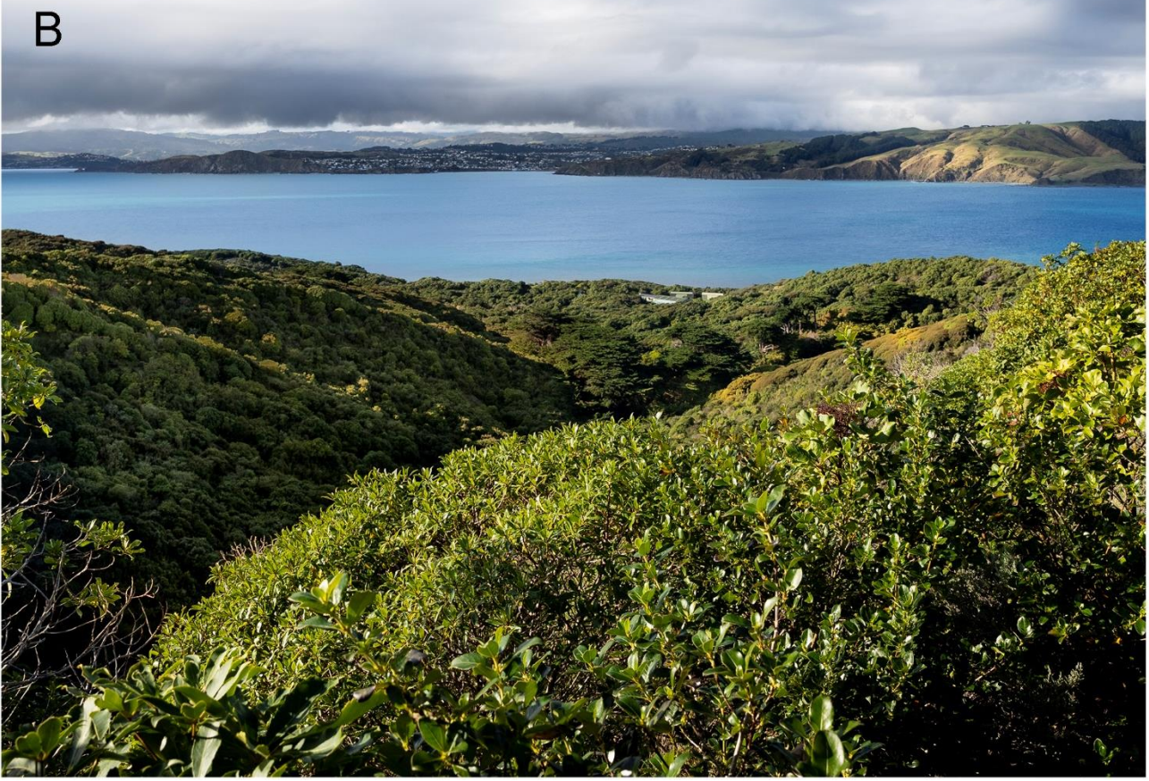
Figure S3. View down Weta Valley to Landing Bay, showing planted vegetation. A. June 1972. B. June 2022.